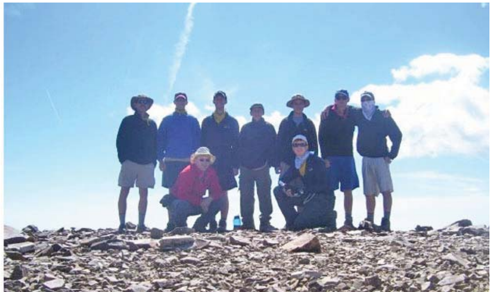
At right: Trek 806K2 on top of Baldy Mountain.