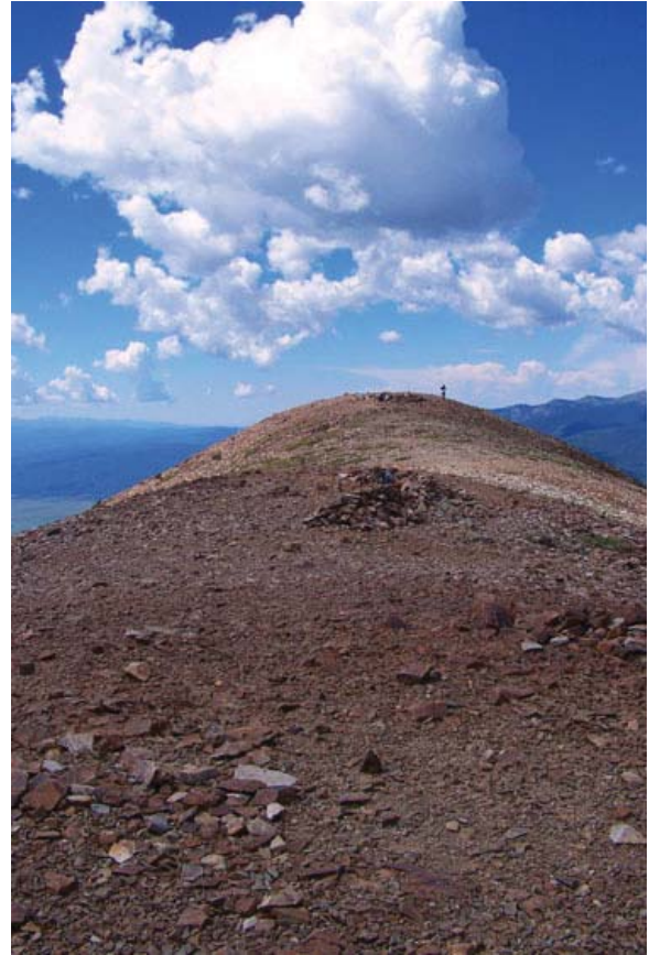
At left: Climbers make their way to the top of Baldy; Above: The desolate landscape at the top of the mountain