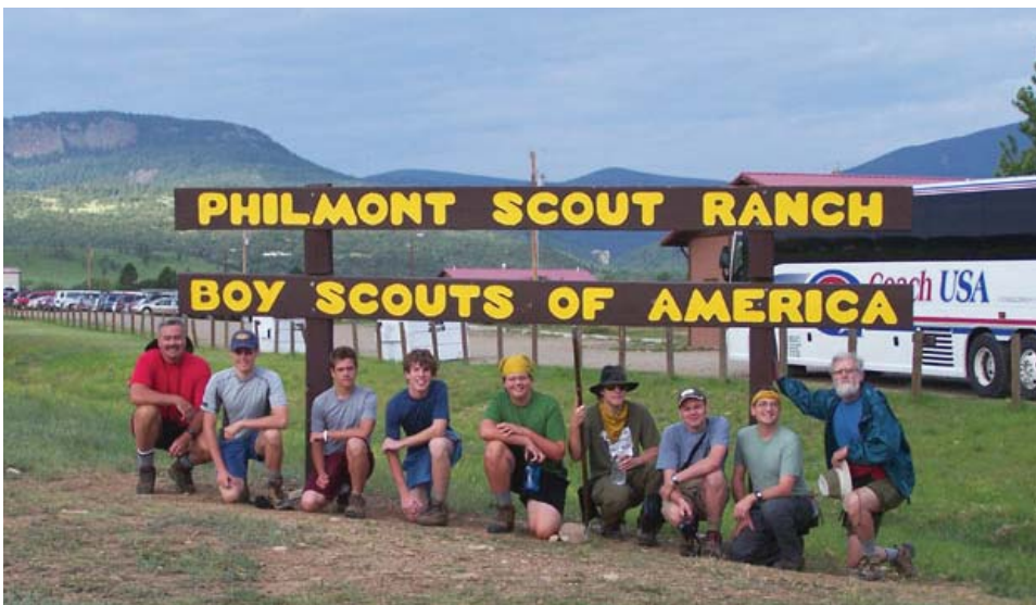
At left: Trek 806K3 at the Philmont entrance.