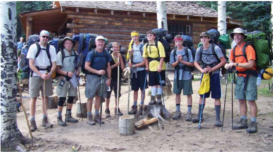
At left: Trek 806K1 packed and ready to go.